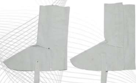
Split Leg Guards