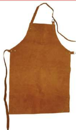
Brown Split Apron

RAMA OVERSEAS LTD. INDUSTRIAL GLOVES & WORKWEAR