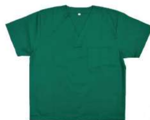
8015 PATIENT SHIRT