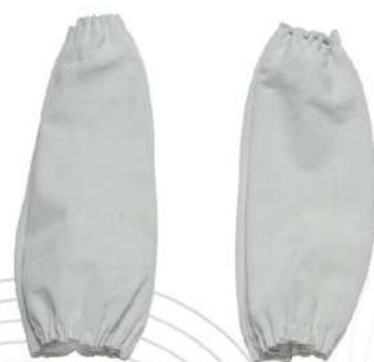
Split Arm Guards